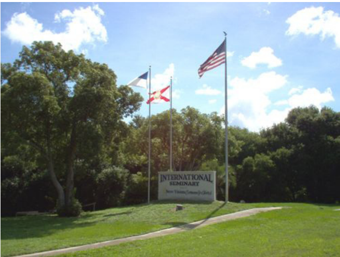
View of flag overlook from Highway 441 (Orange Blossom Trail)

Contributions may be made by remembering International Seminary in your will. The legal form of bequest for International Seminary is as follows: I give, devise and bequeath to International Seminary, a Florida non-profit corporation located in Plymouth, Florida, the sum of $_____ (or property herein described), to be used by the Board of Regents as it may deem advisable for the benefit of the students at International Seminary.